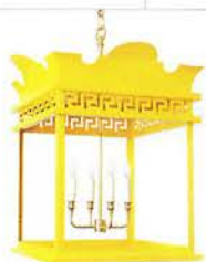
For an extra warm welcome, choose a chandelier with a sunny disposition. The Rothsay Lantern in Daffodil, $3,900; tobiairleyhome.com