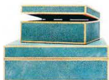
Vivid aqua and contrasting wood trim turns functional storage into a showpiece. Cooper Faux Shagreen Box Set Trimmed in Wood, $969; madegoods.com