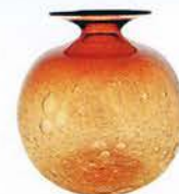
Special accents, like a handblown bubble vase, truly transform a vignette. Tango Flared Bulb Mini Bubble Vase, price upon request; siemonandsalazar.com